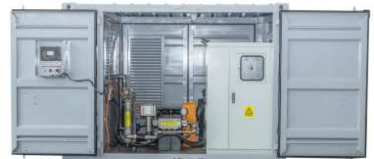
Unit with container