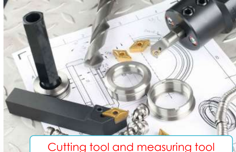
Cutting tool and measuring tool