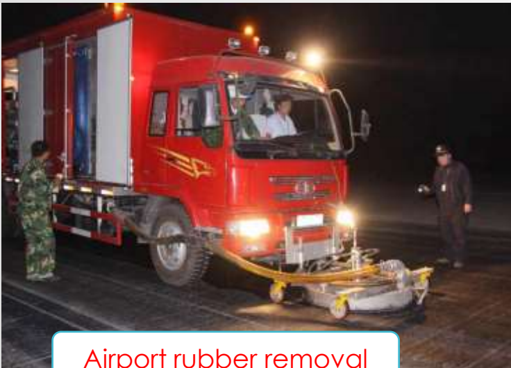
Airport rubber removal