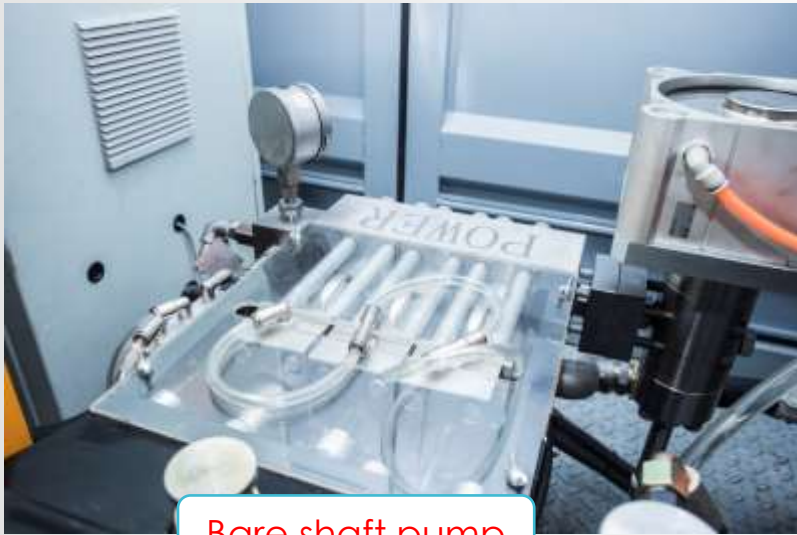
Bare shaft pump