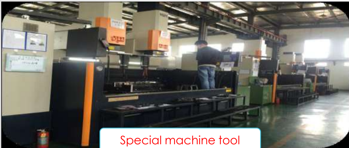
Special machine tool