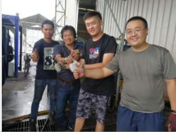
Technical support abroad