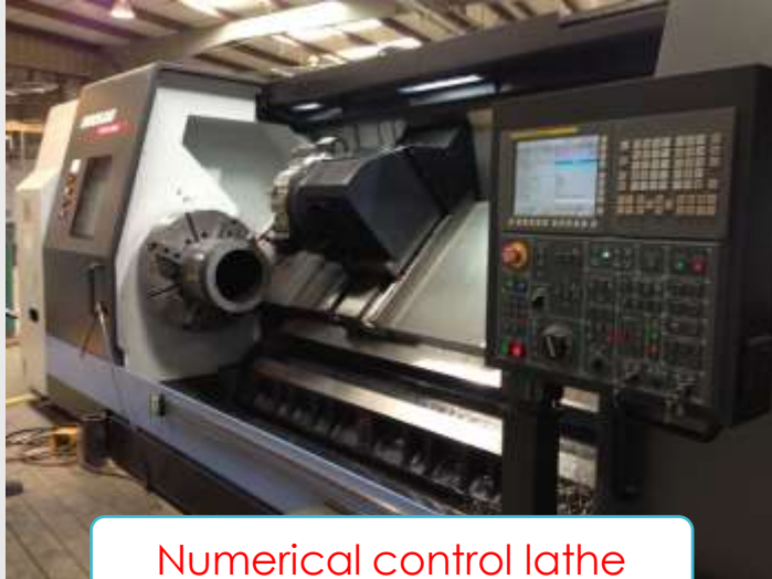
Numerical control lathe